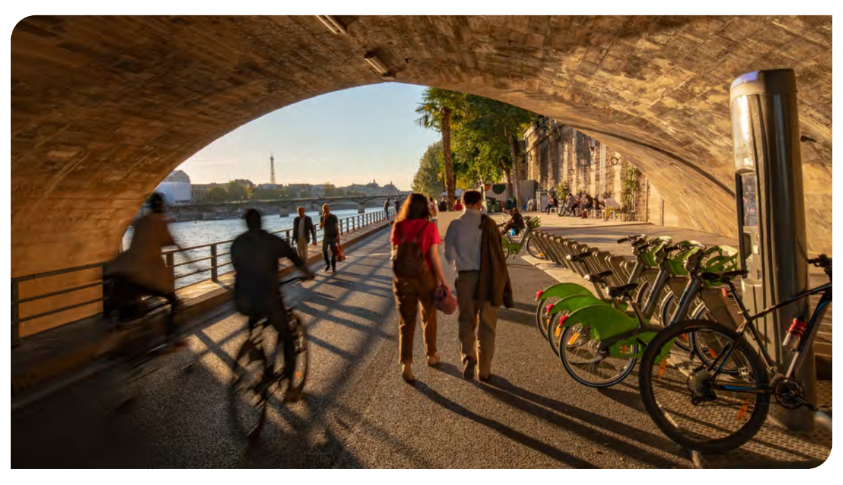
CYCLISTS AND PEDESTRIANS TRAVELING ALONG THE RIVER SEINE AT SUNSET

And speaking of Notre Dame, its reopening in 2024 aligns with what will be a vital year for the city, when it also hosts the 2024 Olympic Summer Games, with many events integrated right into the revered urban fabric. And nothing would go further to demonstrate the city's efficacy in achieving a cleaner, healthier Paris than being able to host swimming events for athletes and the general public post-Games. After wild