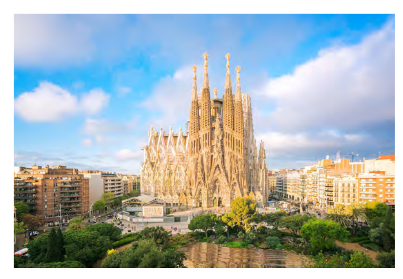
VIEW OF LA SAGRADA FAMILIA

The city's top 10 Outdoors ranking should improve after its renewal. And getting to the city's #10-ranked Sights & Landmarks by bike or foot will also help visitors discover more of its streets. And those are reopening, too. The city's iconic La Rambla boulevard is also in the midst of ambitious renos to make it more walkable with fewer cars, while elevating the area's architecture and art heritage, culminating with the reopening of the area's stunning 17th-century Teatre Principal in 2024.