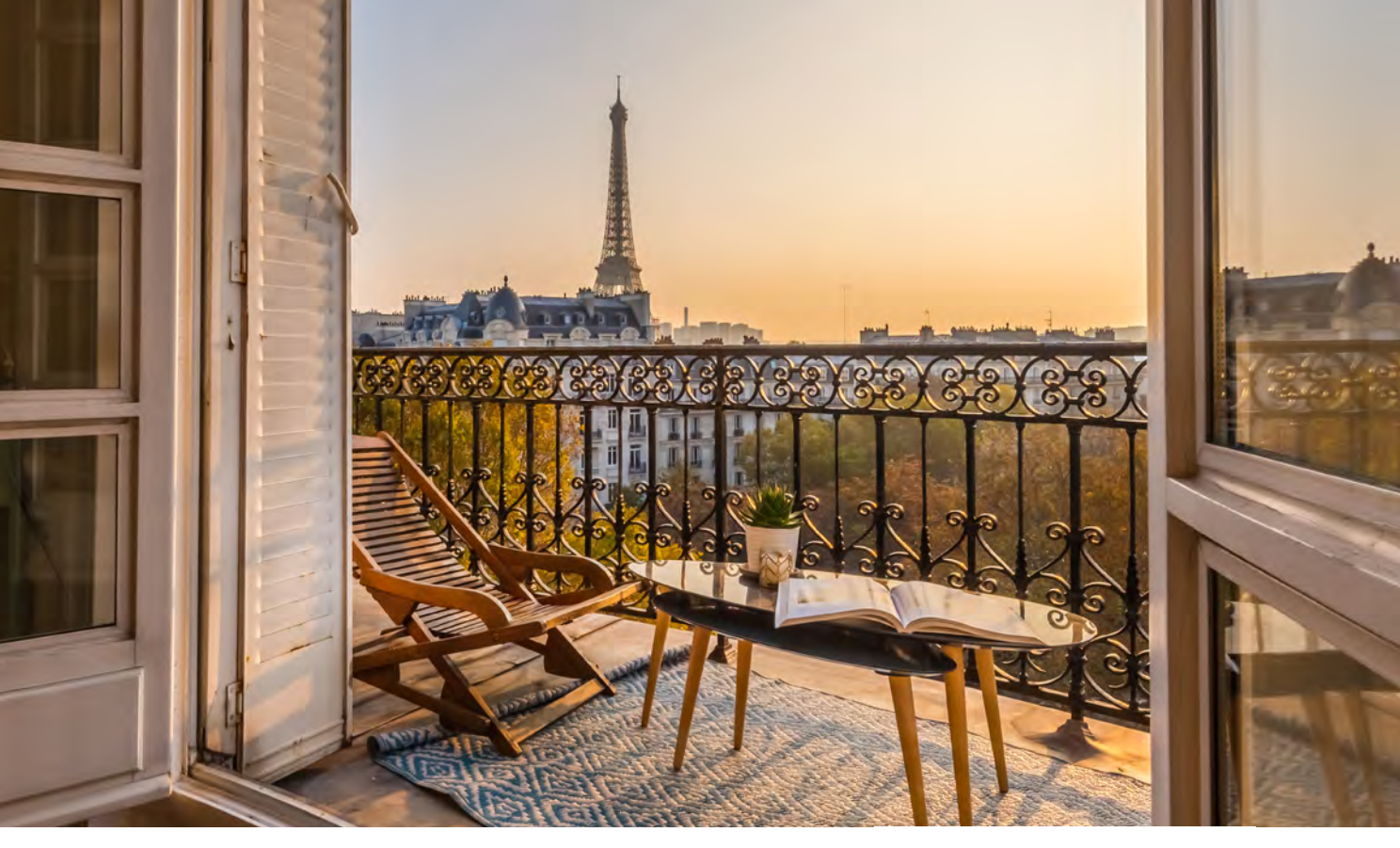
VIEWS OF THE EIFFEL TOWER NEVER GET OLD