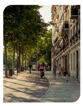
CYCLISTS RIDING ALONG BIKE LANES