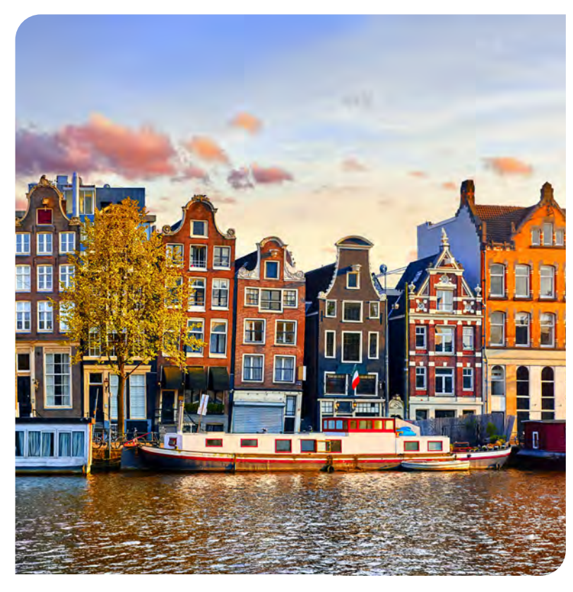
DANCING HOUSES OVER RIVER AMSTEL AT SUNSET

Unsurprisingly, incumbent pillars of industry already using the area don't share the vision.