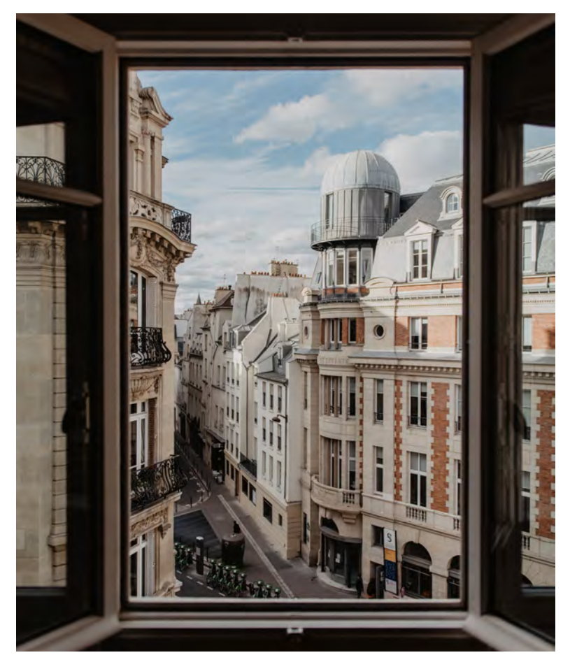
THE STREETS OF PARIS SEEN FROM A THREE-PANEL APARTMENT WINDOW

Atlantic salmon first returned to the Seine 13 years ago, it is today home to more than 30 species of fish, like trout, perch and eel. Considering Paris's plan to hold the 2024 opening ceremonies not in a stadium but by floating down its sacred river, nursing it back to health would be incredibly poetic, even in a town that invented poetic gestures. Those Paris heatwaves would certainly become more tolerable.