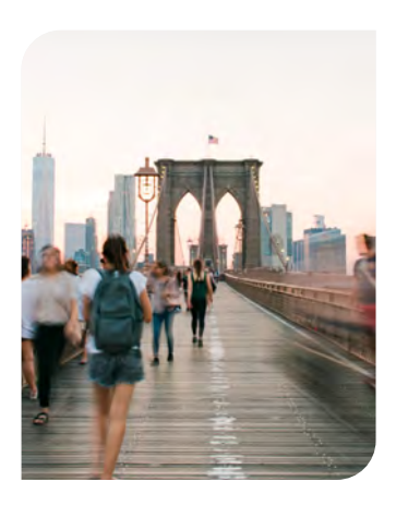
BROOKLYN BRIDGE AT SUNSET