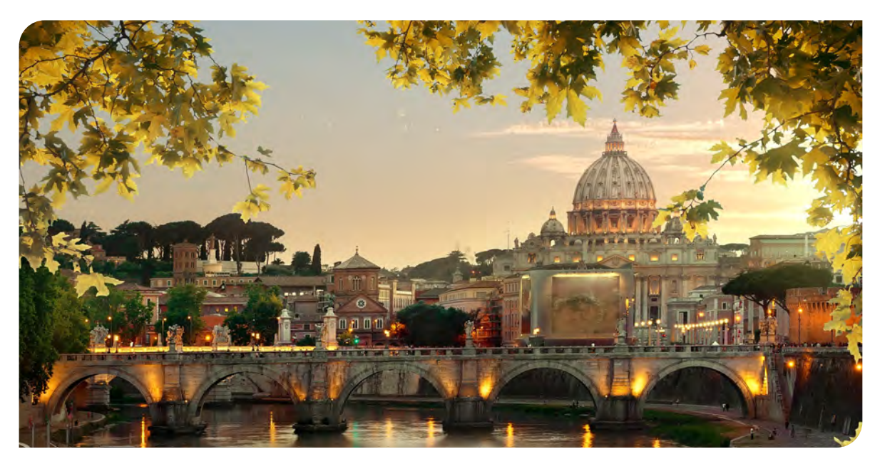
BRIDGE OF SAINT ANGELO AT SUNSET

A dozen other museums and cultural landmarks have also just reopened or have been unveiled for the first time, even in a city where you can't walk a block without running into a millennia-old something. Rome's #7 Museums ranking will rise as a result. Don't miss the reopened Mausoleum of Augustus as well as the Casa Romana, a 4th-century residence underneath the Museo di Scultura Antica Giovanni Barracco. Newcomers include the Museo Ninfeo, which chronicles the ruins of a... let's call it "vacation property"... for Roman emperors.