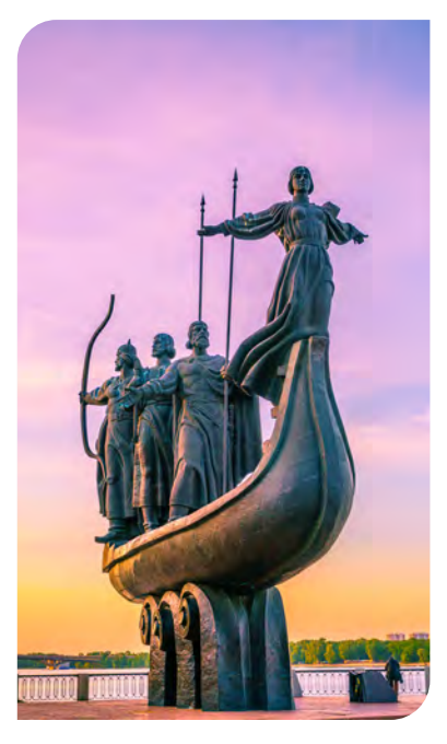
KYIV FOUNDERS MONUMENT, SURROUNDED BY PARKLAND ON THE DNIPRO RIVER

Kyiv's cheap and efficient subway makes it easy for left bank denizens to make their way across the river to the heart of their capital. On a hot day they might first get off at Hidropark, a metro station on an island, to relax at one of its beaches. The mighty Dnipro lapping at their feet connects over two dozen Ukrainian cities to the Black Sea, provides drinking water and hydroelectricity to many of their fellow citizens and forms an indelible part of the country's heritage, glorified by national poet Taras Shevchenko as the symbol of Ukraine's fate.