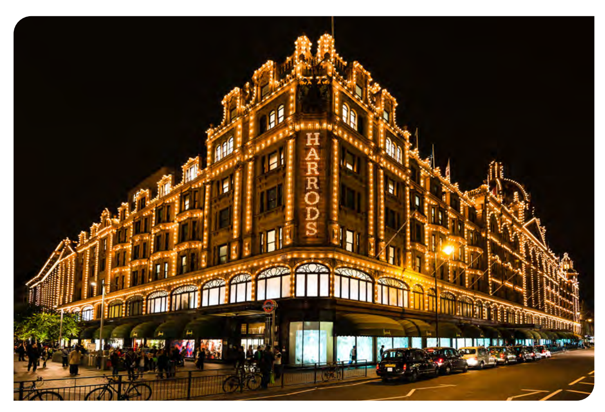
VIEW OF HARRODS AT NIGHT ON BROMPTON ROAD, KNIGHTSBRIDGE

Of course none of this happens without the sustained facilitation of London & Partners, London's official publicity arm, and the economic development organization that works to offer financial perks for all that relocation.