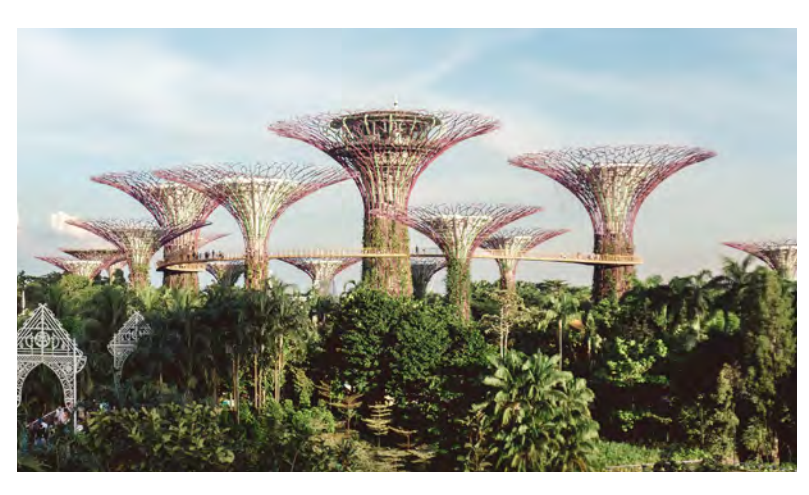
GARDENS BY THE BAY

Of course the city's Safdie Architectsdesigned $1.7-billion Jewel Changi Airport, opened in 2019 a few months before lockdowns, is also worthy of a few hours of exploration. It's already helped the city get into our top 50 Airport Connectivity ranking.