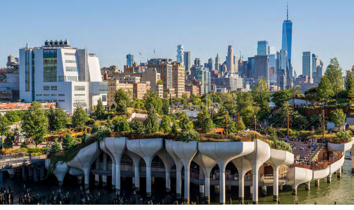
LITTLE ISLAND PARK, WEST SIDE MANHATTAN